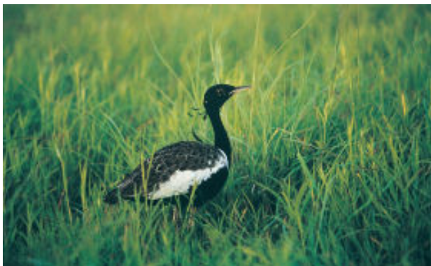
The Lesser Florican is totally dependent on semi-arid grasslands for breeding and foraging

As the Lesser Florican is a monsoon breeder, the conservation of this species and protection of natural fodder (grass) are compatible because by the time the grass is ready for harvesting, the main breeding period of the florican is over. By delaying grass cutting by a week or leaving a small patch of