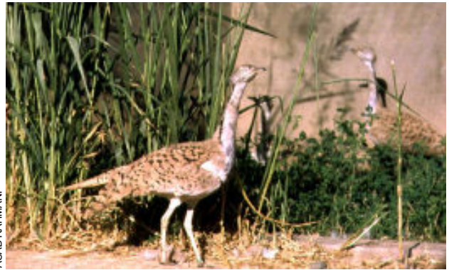
Houbara Bustard is one of the most widespread bustards of the world but everywhere it is persecuted by hunters

Among all the sanctuaries where Houbara is positively seen only Velavadar National Park in